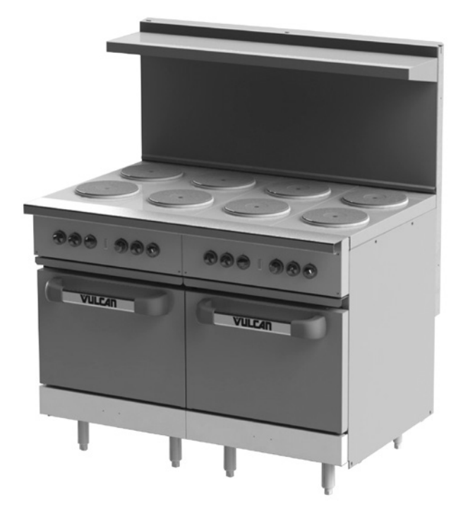
Model EV48SS-8FP208 shown with adjustable legs