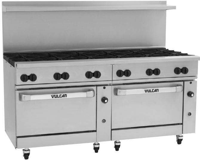
Model 72SC-12BN (shown with optional casters)