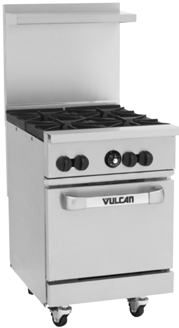
Model 24S-4N (shown with optional casters)