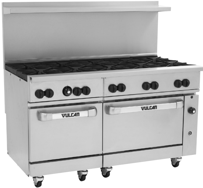
Model 60SS-10BN (shown with optional casters)