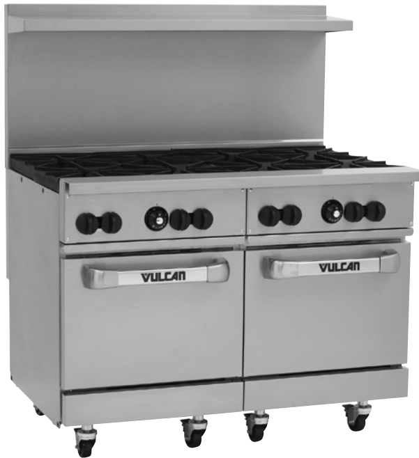
Model 48SS-8BN (shown with optional casters)