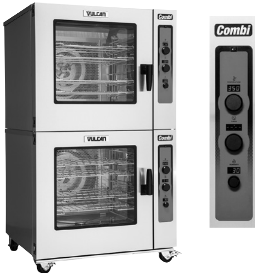
Model ABC7E (shown stacked)